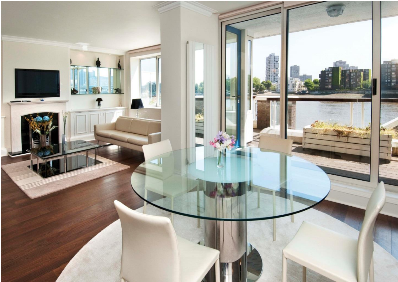
As previously furnished

A beautiful, interior-designed, three bed, raised-ground floor apartment, which benefits from one underground parking space and two decked terraces, one overlooking the river, the other with views to the Marina. The apartment is light, bright and offers exceptional views of the river from the reception room as well as views of the marina from all three bedrooms.